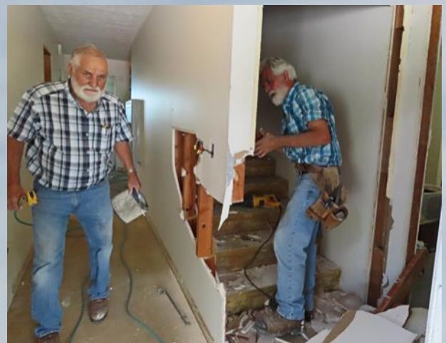
Team #2 from Shiloh Mennonite Church in Ohio