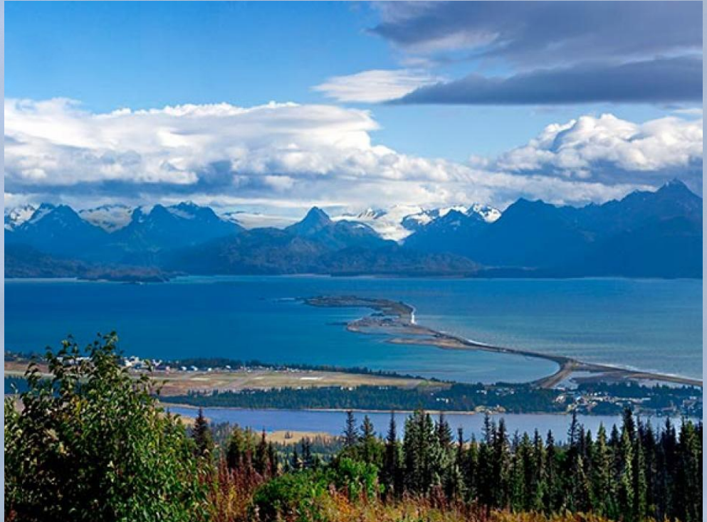
The Homer Spit and Kachemak Bay (from the City of Homer website)