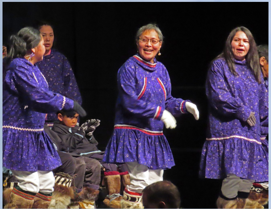
AFN evening entertainment: Nunamiut dancers from Anaktuvuk Pass